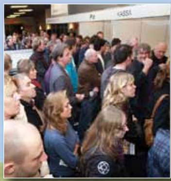
Entrance BioVak, 14.00 hrs

The enormous interest BioVak 2011 generated was once again beyond our expectations and exceeded the preceding years. More than 17,000 visitors were welcomed. After a festive opening with 26 Dutch mayors performing the official ceremonies,