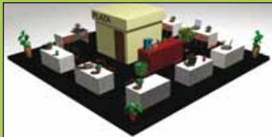
Your presentation table