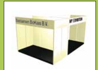
Ready-made stand 8 m2