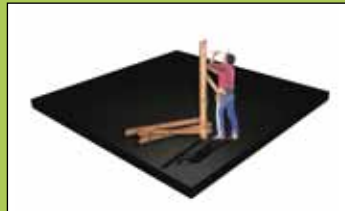
Do-it-yourself stand or with a stand builder